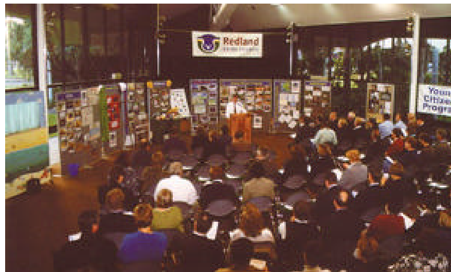
Teacher attend YCP Annual Breakfast