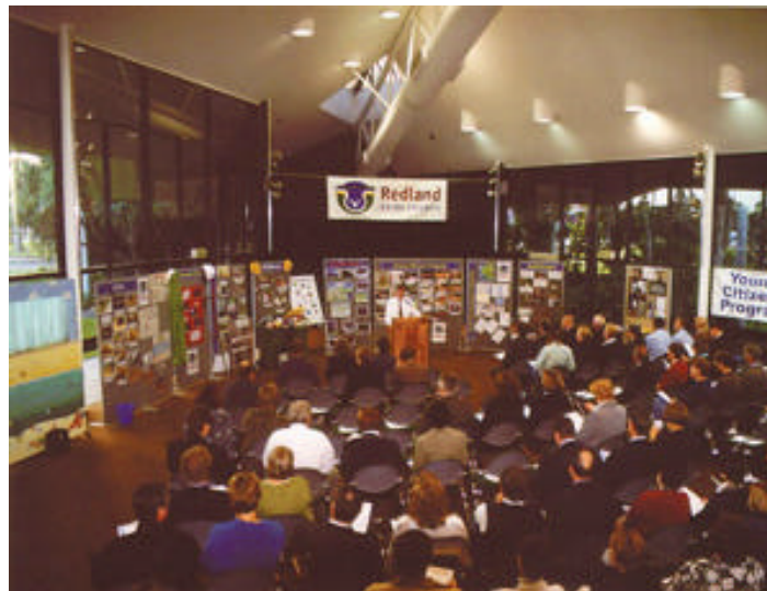
YCP Annual Breakfast