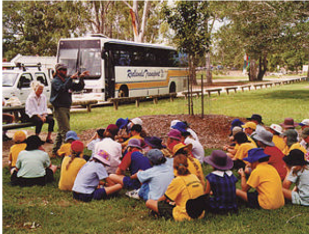
Students attend IndigiScapes