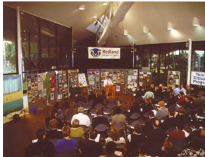
YCP Annual Breakfast