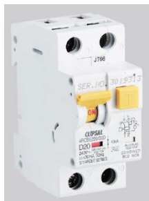
Fixed safety switch (e.g. installed on switch board)