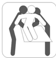
Two Person Assist with Equipment