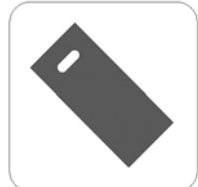
Slide Sheet / Equipment