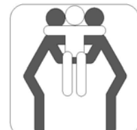
Two Person Assist (side by side)