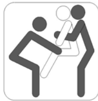
Two Person Assist (top & tail)