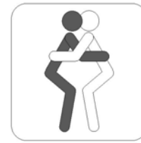
One Person Assist