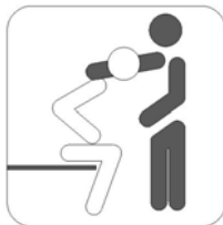
Minimal Assistance Only