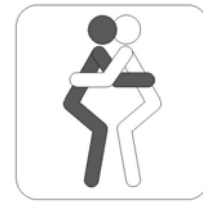
One Person Assist