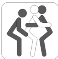
Two Person Assist