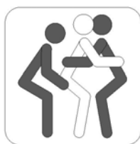
Two Person Assist