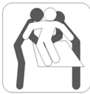
Two Person Assist with Equipment