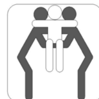
Two Person Assist (side by side)