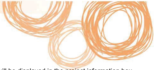
Photo: add a photo to your project. The photo will be displayed in the project information box when visitors search the list of projects.

Password: use a password if you want specific participants. You are responsible for providing your participants with the password. This adds a second layer of privacy.