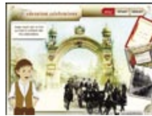
Citizens' Arch (Series) Learning Object

Developed by The Learning Federation for use in classrooms, this Learning Object assists in the exploration of Australian history for Australia Day. Through the Citizens' Arch (built in 1901 to celebrate the opening of the first Federal parliament) students find out about Australian Federation. The Citizens' Arch series includes: