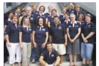
The 2006 Learning Place Mentors.