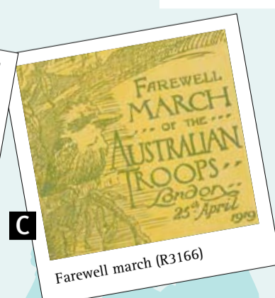
C Farewell march (R3166)