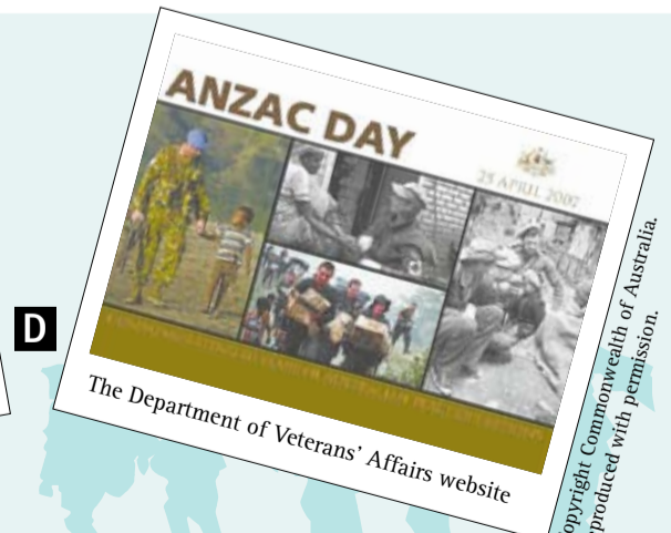
D The Department of Veterans' Affairs website

Copyright Commonwealth of Australia. Reproduced with permission.