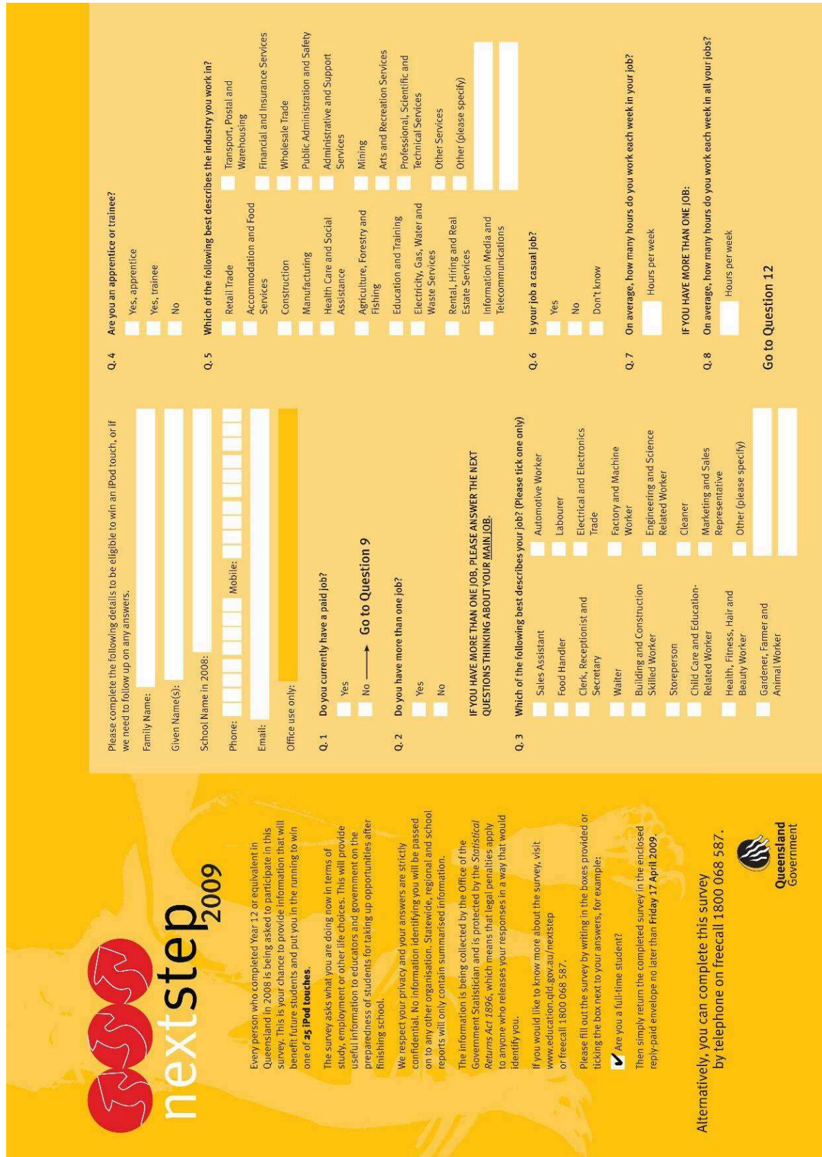
Figure A3A Paper-based survey instrument