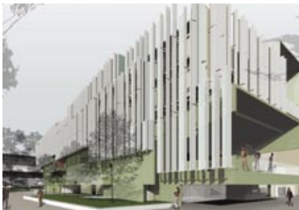
Architect's impression (January 2005) of the State Library of Queensland redevelopment