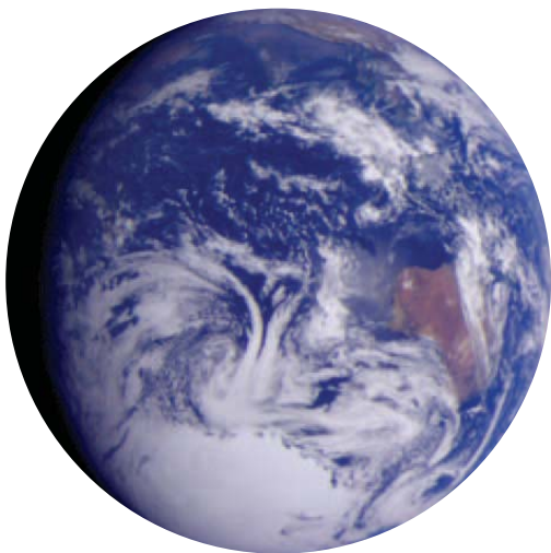
Image Source: NIX - NASA Image eXchange, Image No. PIA00122. Reproduced with permission as outlined at http://nix.nasa.gov/ .

The QESSI Alliance Strategic Plan is based on the Earth Charter philosophy. ( www.earthcharter.org )