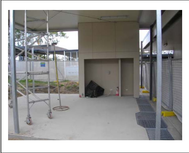
New outdoor learning area