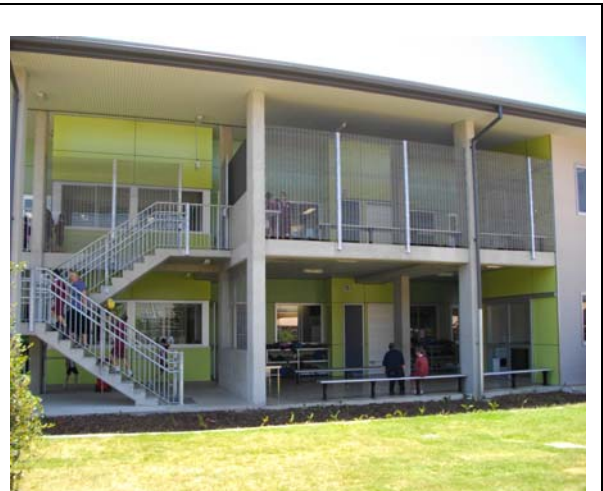
New 8 space Teaching Block