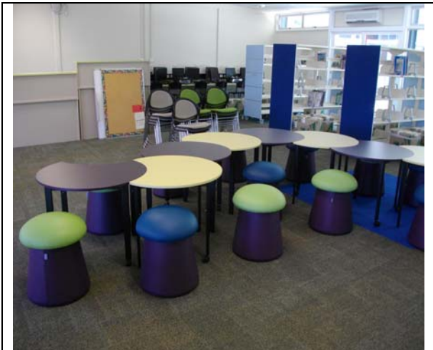
Refurbished Library with new furniture