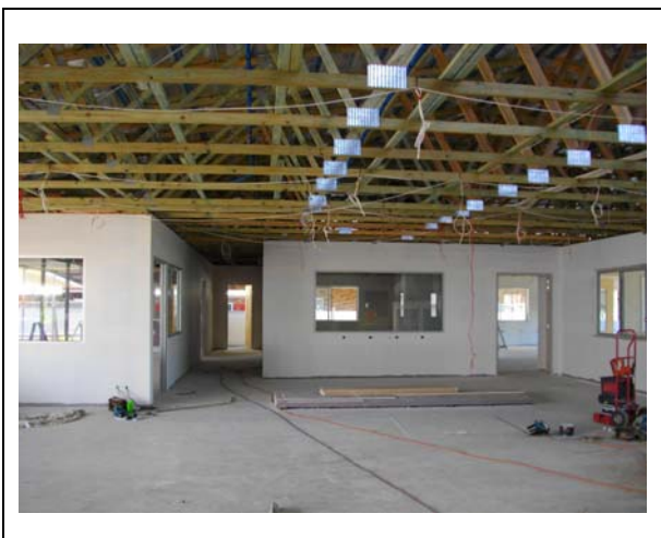
New Resource Centre