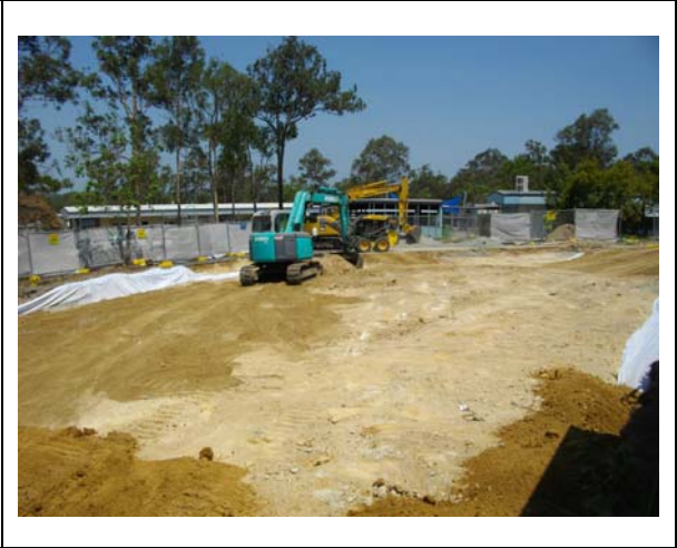
New staff and visitors car park