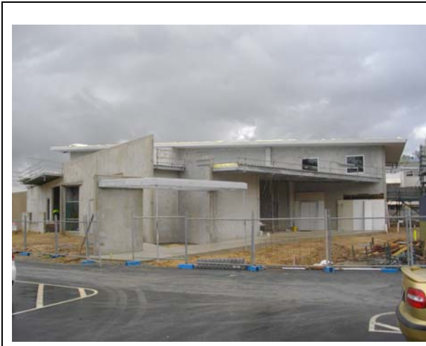
New Performing Arts Centre