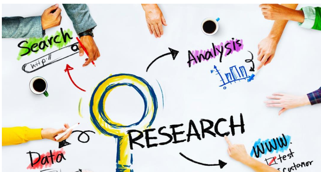
© State of Queensland (Department of Education) 2018 Photography attribution: istockphoto