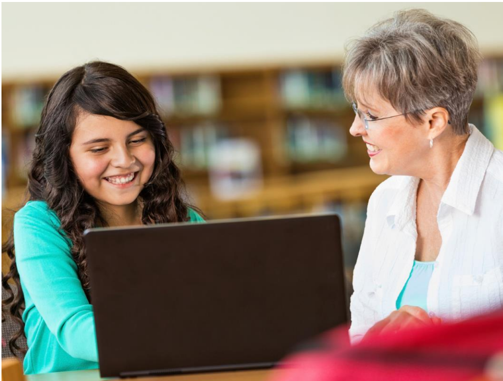
© State of Queensland (Department of Education) 2018 Photography attribution: istockphoto