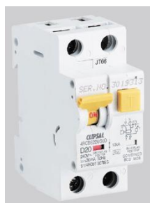
Fixed safety switch (e.g. installed on switch board)