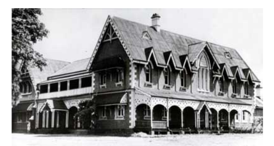
Photograph: Opened in prosperous times in 1883, the Maryborough Grammar School was taken over by the Department of Education in 1936 to become the Maryborough State High and Intermediate School for Boys.

From 1925 until the later 1930s there was little expansions in secondary education, one significant reason being the depressed economic conditions of much of this period. Though several new secondary departments were provided, Ayr state High School, opened in 1937, was the only new high school. In 1936, the Maryborough Grammar Schools for Girls and Boys were taken over by the Department.